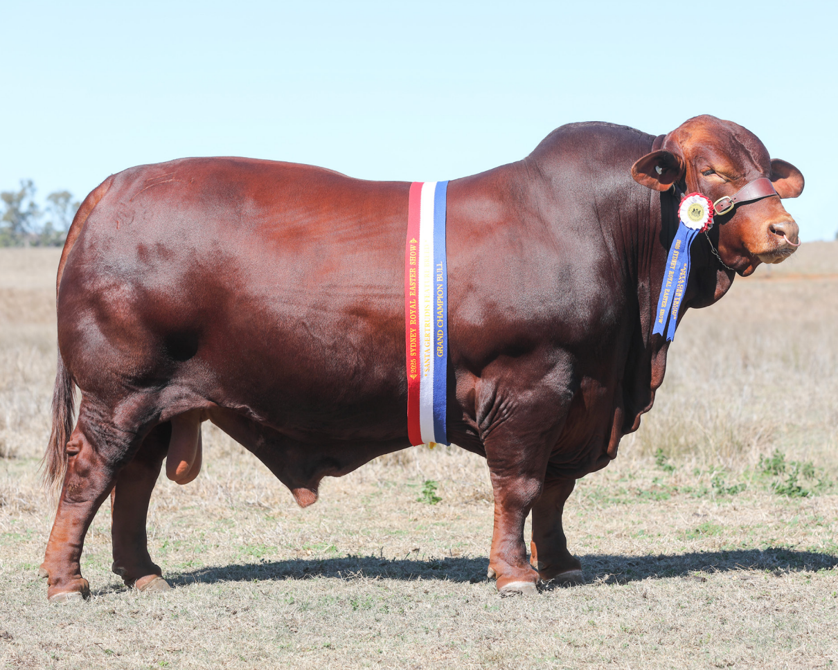
SYDNEY 2025 • EKKA 2025 GRAND CHAMPION SANTA GERTRUDIS BULL Santahat Ultimate U300 (P)